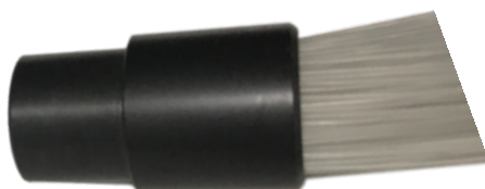
COMMON END FIBRE OPTIC BUNDLE