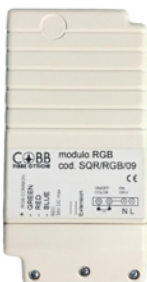
COLOR CONTROL MODULE