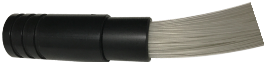
FIBRE OPTIC BUNDLE

INSERT THE COMMON END IN THE LIGHT SOURCE AND BLOCK IT THROUGH THE SCREW SET ON THE LIGHT SOURCE