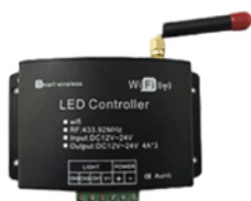
WIFI RECEIVER MODULE