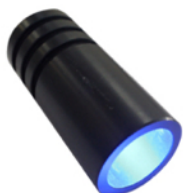
3W RGB LIGHT SOURCE