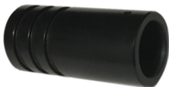
3W LED LIGHT SOURCE